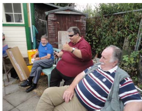
Our team of advisors !!

And thanks to all who helped make the day a success.