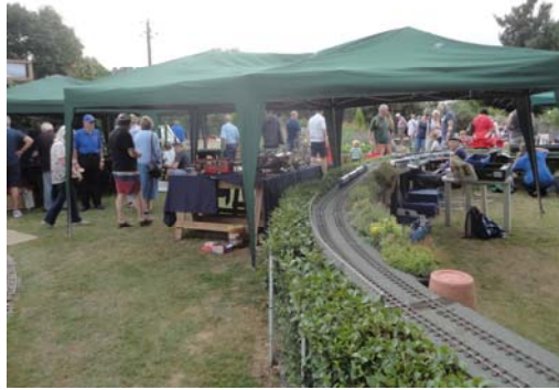
The show is open...