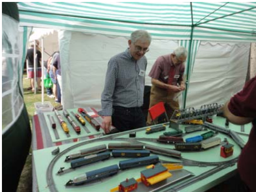
A bit of nostalgia, Tri-ang trains