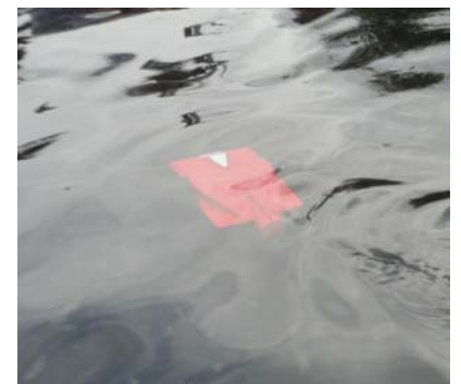
It is suppose to be under water!