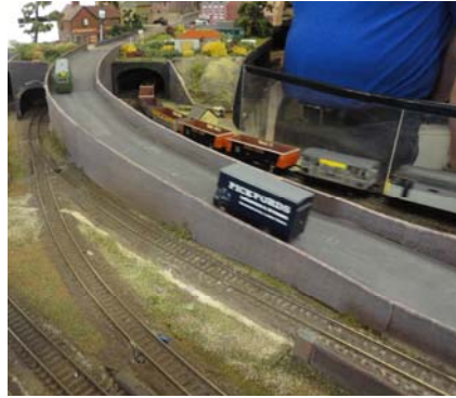
The '00' layout in the clubhouse had moving vehicles on the road. A Pickfords pantechnicon is following a Green Line 'bus.'