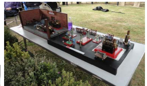
Steam operated model workshops