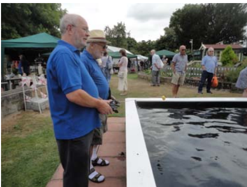
Radio controlled boats