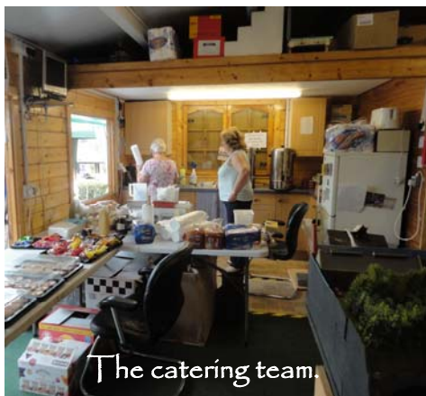
The catering team.