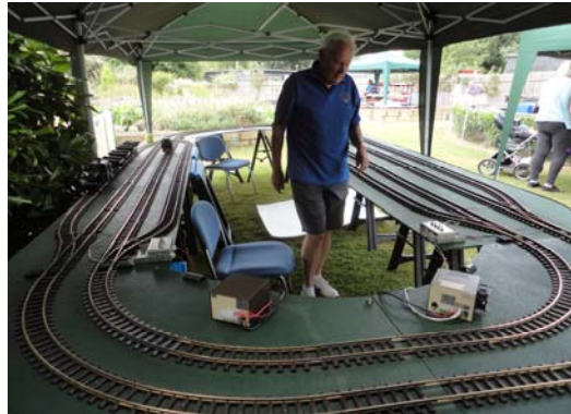
The club's portable 'G' scale