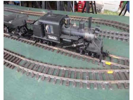
'G' scale Climax U.S. logging loco.

The large layout is the garden type (commonly called 'G' scale) but, surprisingly, does lend itself to being portable for exhibitions.